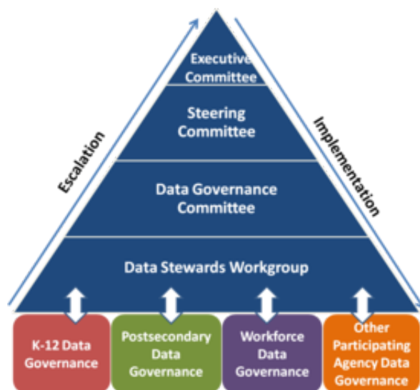
VLDS Data Governance